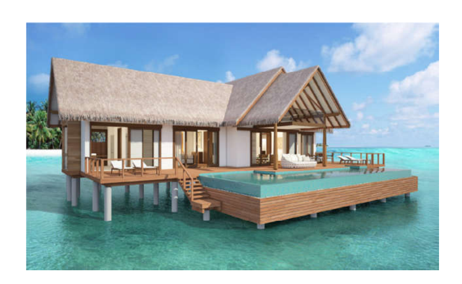
King Sized Bed | Over-sized Day Bed | Private Plunge Pool (Water Suites & Presidential Water Suite) | Jacuzzi Bathtub | Marshall Bluetooth Speaker / Pillow Menu / Private Sun Deck | Espresso Machine | Safety Box | Wi-Fi Access | Flat Screen TV | Butler Service (Duplex Ocean Suites & Ocean Residence)