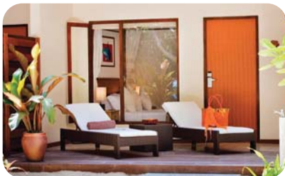
12 Garden Villas - 45 sqm

Check-in is at 14:00hrs, check-out is at 12:00hrs.