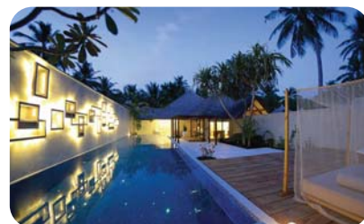
2 Honeymoon Pool Villas - 310 sqm

These villas are identical to the Water Villas with Pool, in style and in size, yet provide for even a better experience as they are located just on the edge of the famous Kuramathi sand bank.