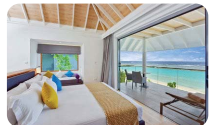
35 2-Bedroom Beach Houses - 205 sqm

Facing the turquoise lagoon, these villas feature oversized wooden decks with sunloungers, sun umbrella and daybed. The bedroom features a king-sized four-poster bed and a built-in sunlit daybed. The bathroom has a bath/shower, twin vanities, and a large outdoor area with a rainfall shower, outdoor daybed, and an inviting jacuzzi on an elevated deck. The added luxury of an espresso machine with complimentary refill is included from this villa category upwards.