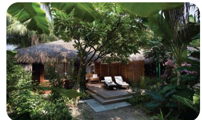
33 Beach Villas with Jacuzzi - 90 sqm

The Beach Villas are individual villas hidden within the abundant vegetation, yet only a few steps away from the beach. Facing the lagoon side of the island, they feature king-sized four-poster beds, wooden decks at the front with daybed and sunloungers. The Beach Villas also include semi-open air bathrooms with outdoor rainfall shower.