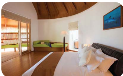
35 Superior Beach Villas with Jacuzzi - 90 sqm

Sited amongst the natural gardens of the island, the wooden Beach Villa with Jacuzzi features king-sized four-poster bed and an inviting daybed, whilst the deck outside offers daybed and sunloungers for two. The bathroom is large and open air, and includes a tempting jacuzzi in the corner.