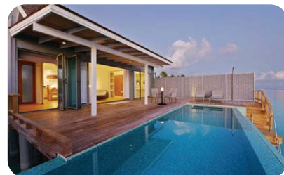
33 Water Villas with Pool - 142 sqm

Set in the middle of our vast turquoise lagoon, the Deluxe Water Villa feature a king-sized bed and a daybed. The spacious bathroom offers a freestanding bath, and opens onto an expansive deck with steps down to the azure waters. In addition to the wide range of in-villa amenities, all villas from this category upwards also feature a fuller minibar complete with a separate wine chiller featuring over 30 bottles from around the globe.