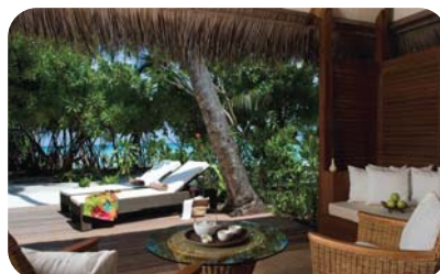
31 Deluxe Beach Villas with Jacuzzi - 95 sqm

These villas are contemporary in design. Round in shape, the villa includes a wooden deck featuring an alluring built-in outdoor daybed and sunloungers. The bedroom is spacious and minimalist, displaying a modern king-sized low bed as the centrepiece. The open air bathroom leads to an outdoor jacuzzi.