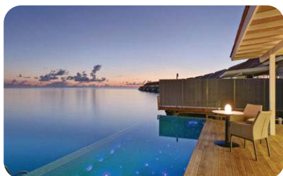
16 Thundi Water Villas with Pool - 142 sqm

Set right at the edge of the beach, enter the Pool Villas through your own private courtyard. The bedroom boasts views out to the infinity pool (18sqm) matching the picturesque vista beyond. The villa is furnished with a walk-in wardrobe and an indoor bathroom complete with a free standing bath, twin vanity, and a separate outdoor rainfall shower.