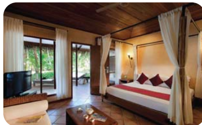
71 Beach Villas - 70 sqm

With four built together, the Garden Villas are simple yet stylish and feature a semi-open air bathroom with rainfall shower. Close to the beach and the pristine blue waters, they provide for our most affordable Kuramath experience.