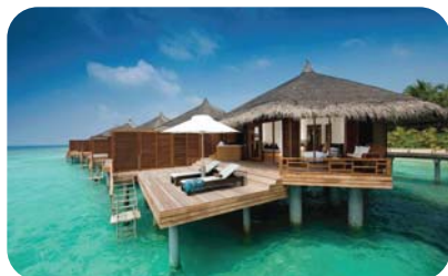
50 Water Villas with Jacuzzi - 90 sqm

These magnificent villas are built on stilts, close to the house reef with its colourful myriad of marine life. The villa features an airy bedroom with king bed and a spacious bathroom with twin vanities and rainfall shower. The villas also include an oversized two-tiered sundeck with your jacuzzi, sunloungers and sun umbrella. Enjoy panoramic views of the Indian Ocean.