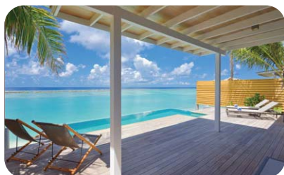
12 Pool Villas - 165 sqm

The Water Villas with Pool are located either in the crystal clear lagoon or facing the house reef, all featuring modern interiors similar to the Deluxe Water Villas. These villas also include a private pool (18sqm) overlooking the ocean.