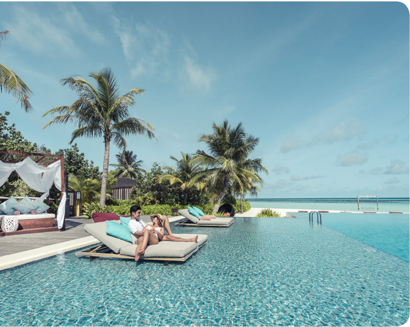
Main swimming pool Outdoor pool