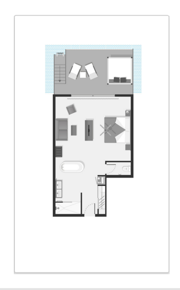
SJME - Overwater Superior Junior Suite