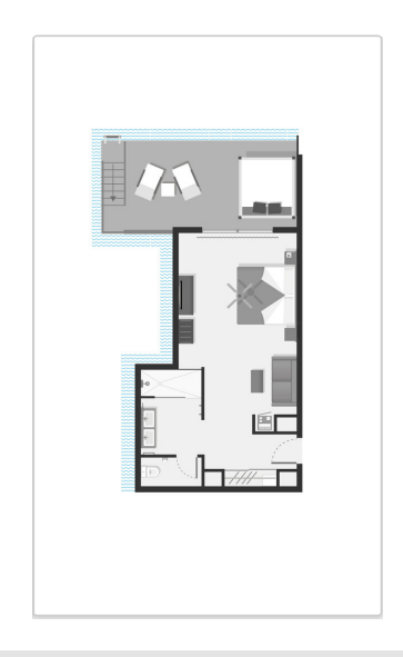
SJMB - Overwater Junior Suite