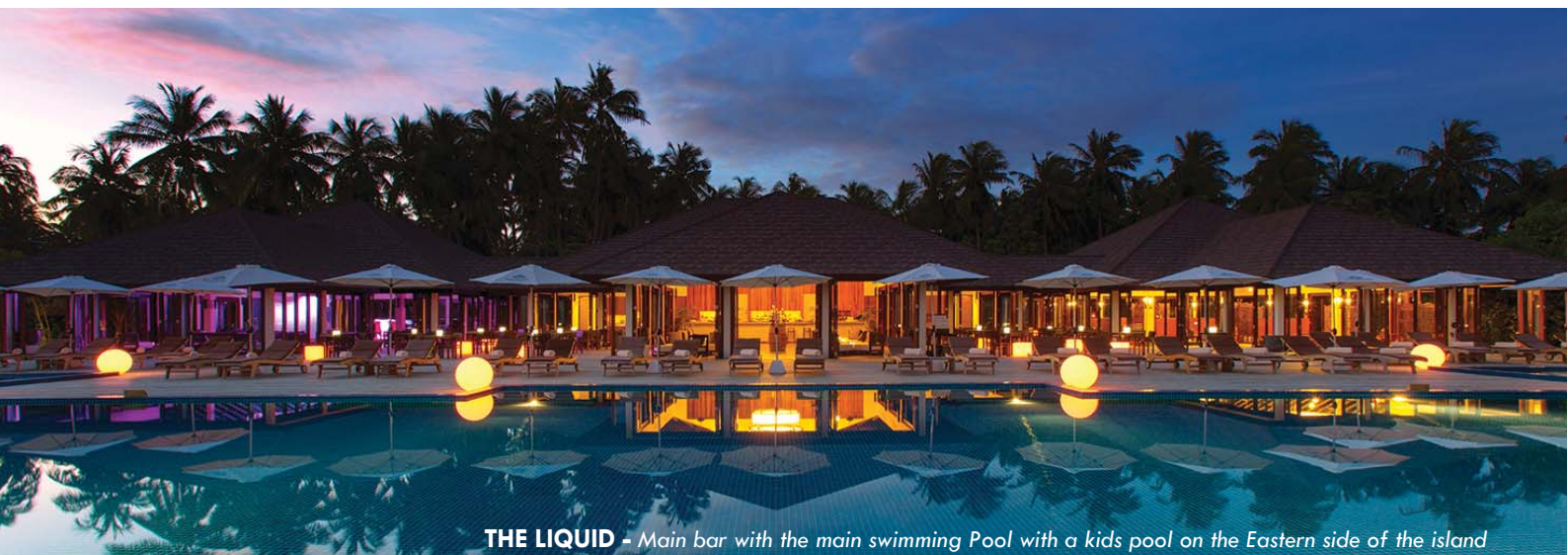
THE LIQUID - Main bar with the main swimming Pool with a kids pool on the Eastern side of the island