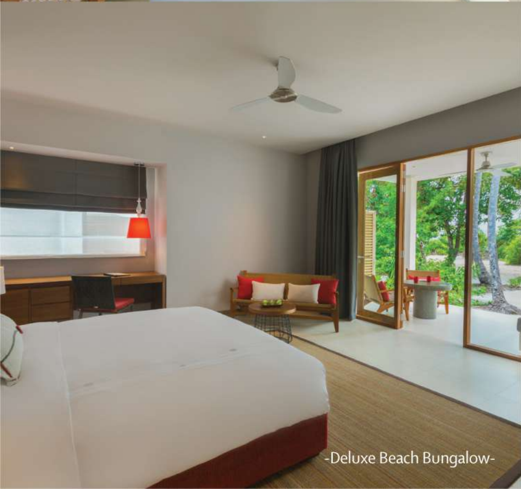
-Deluxe Beach Bungalow-