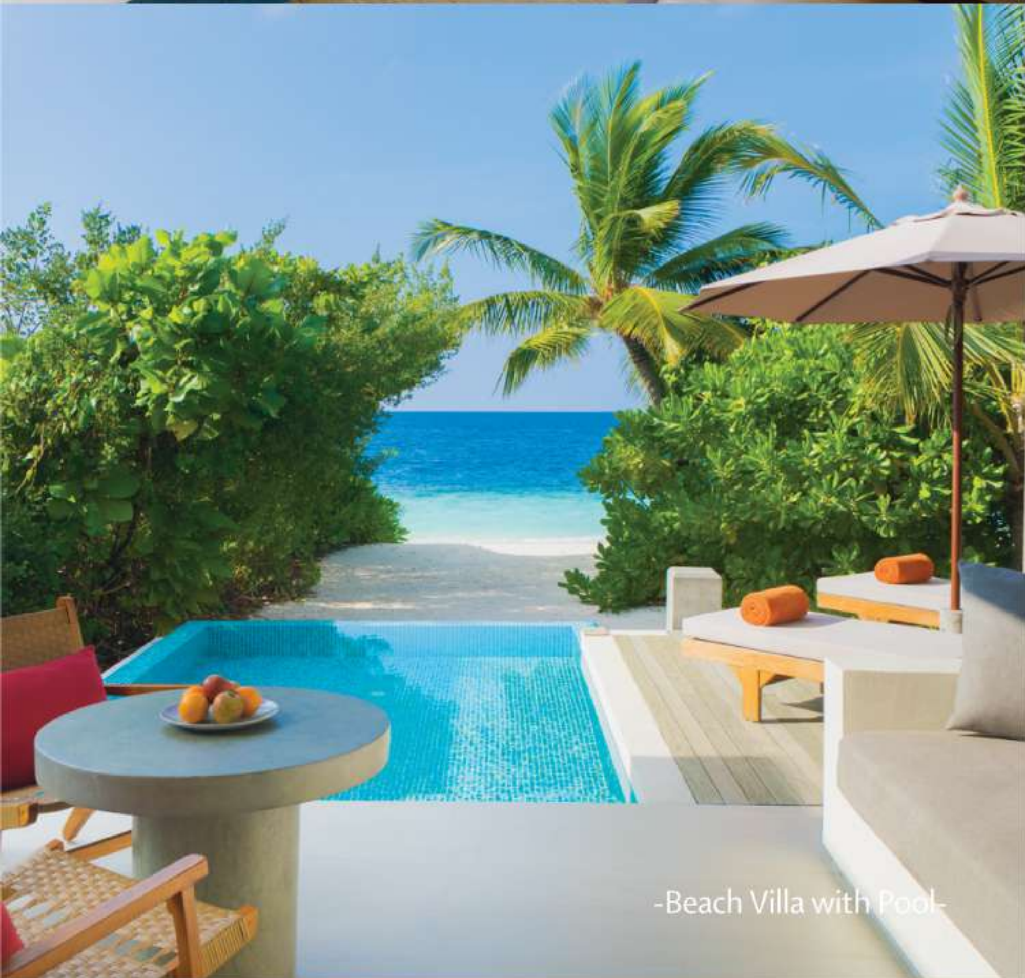
-Beach Villa with Pool-